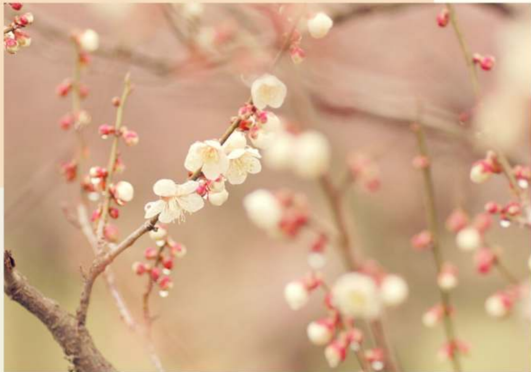
LA VISTA CITY - GOLDEN SQUARE EXTENSION