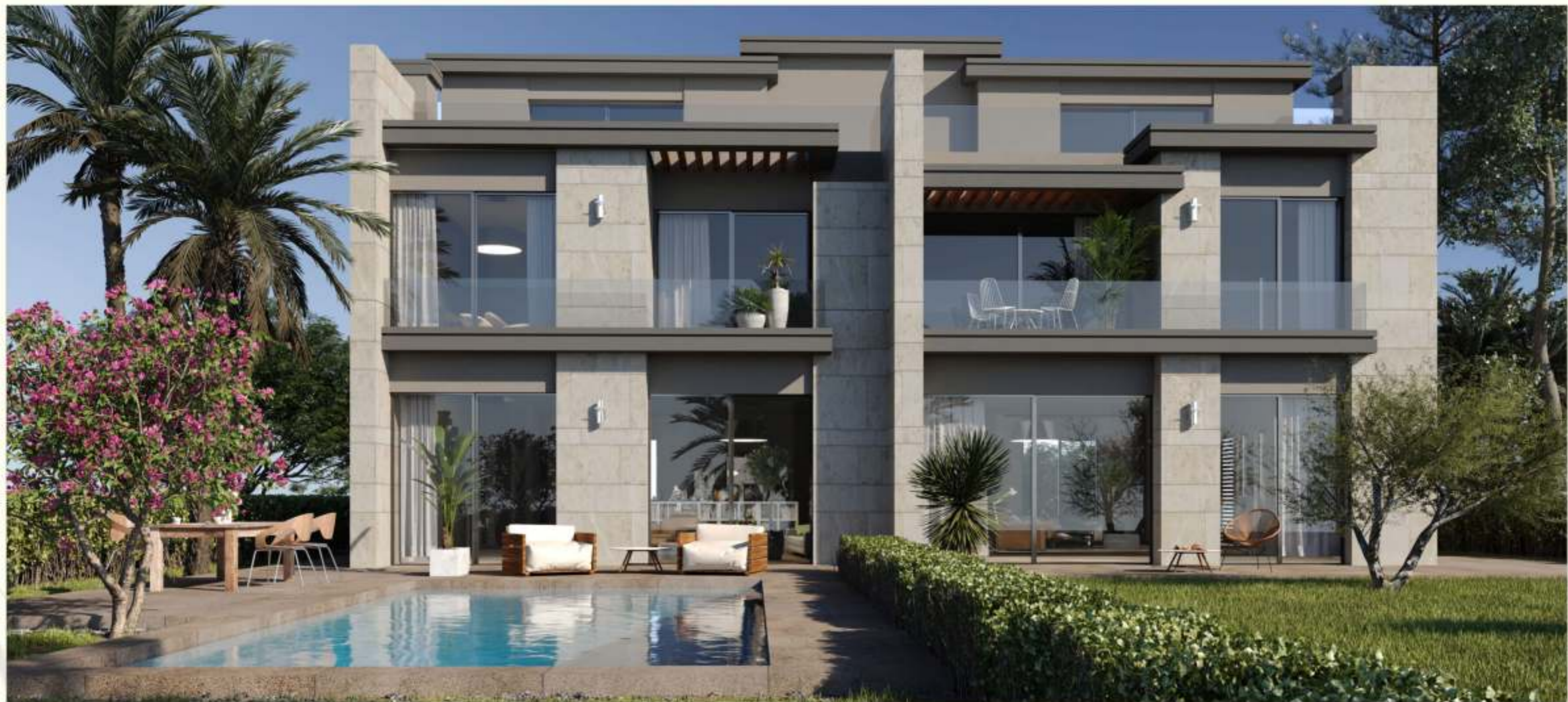
LA VISTA CITY - GOLDEN SQUARE EXTENSION