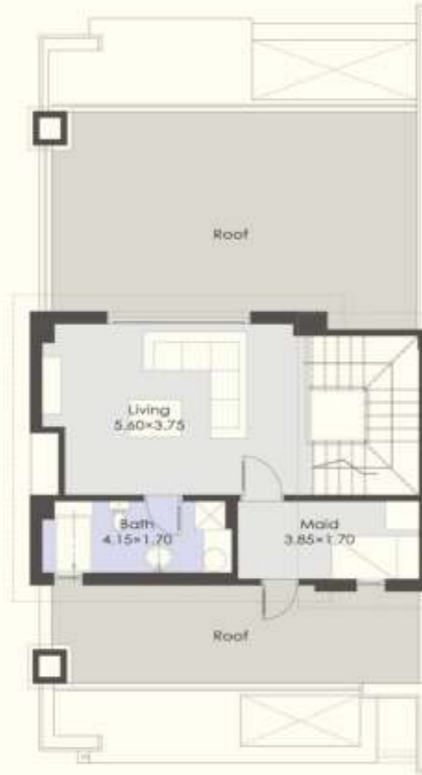
Roof Floor Plan