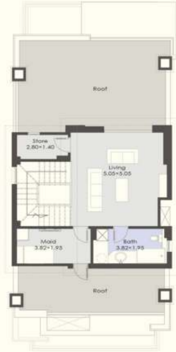
Roof Floor Plan