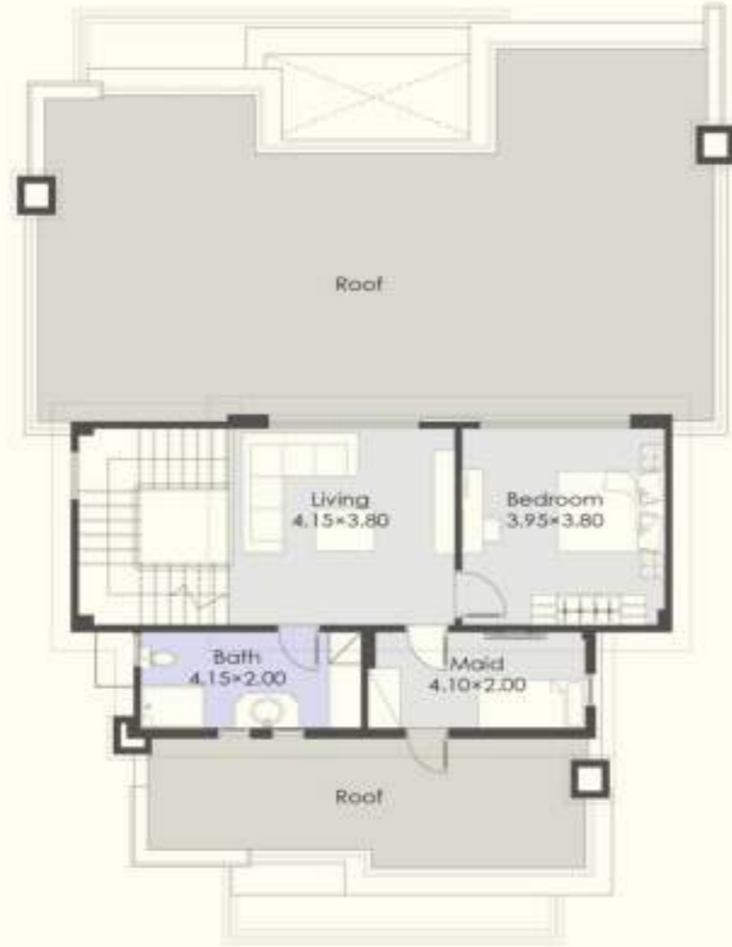
Roof Floor Plan