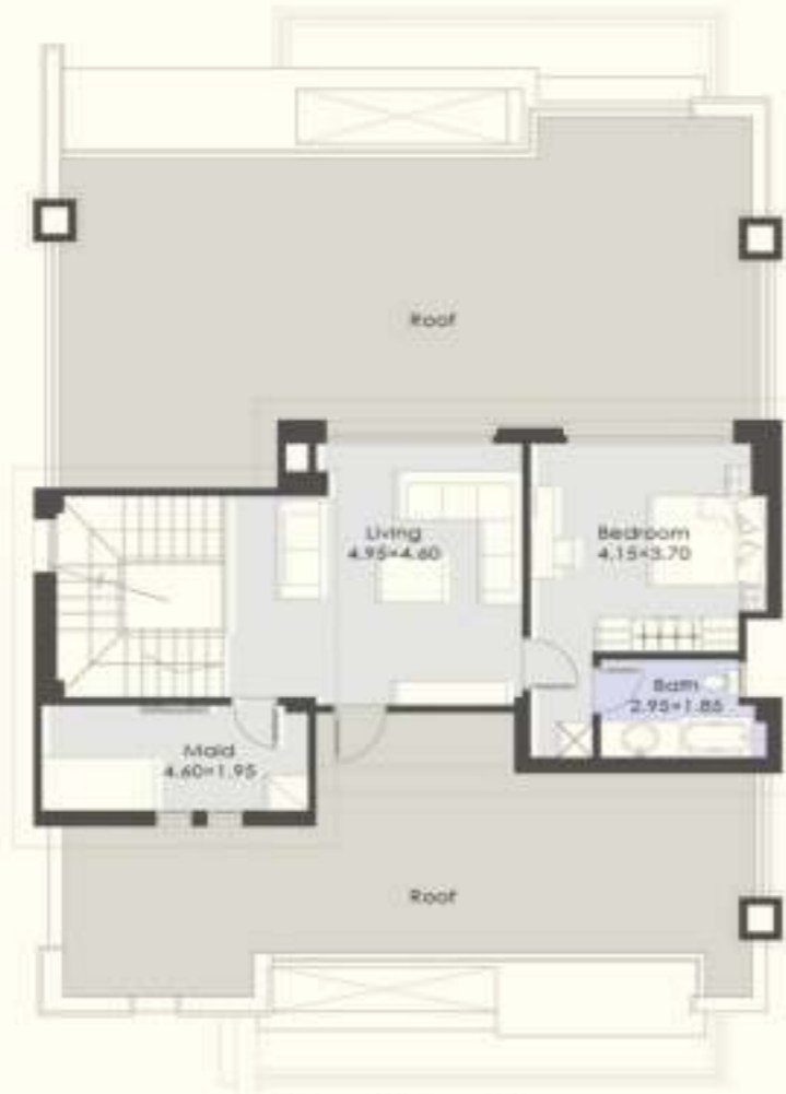
Roof Floor Plan