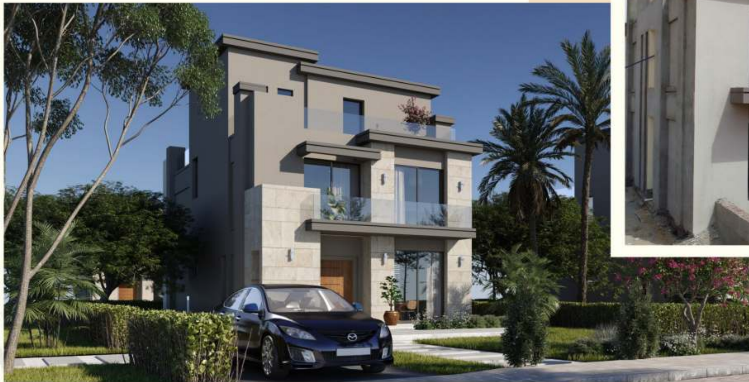
LA VISTA CITY - GOLDEN SQUARE EXTENSION