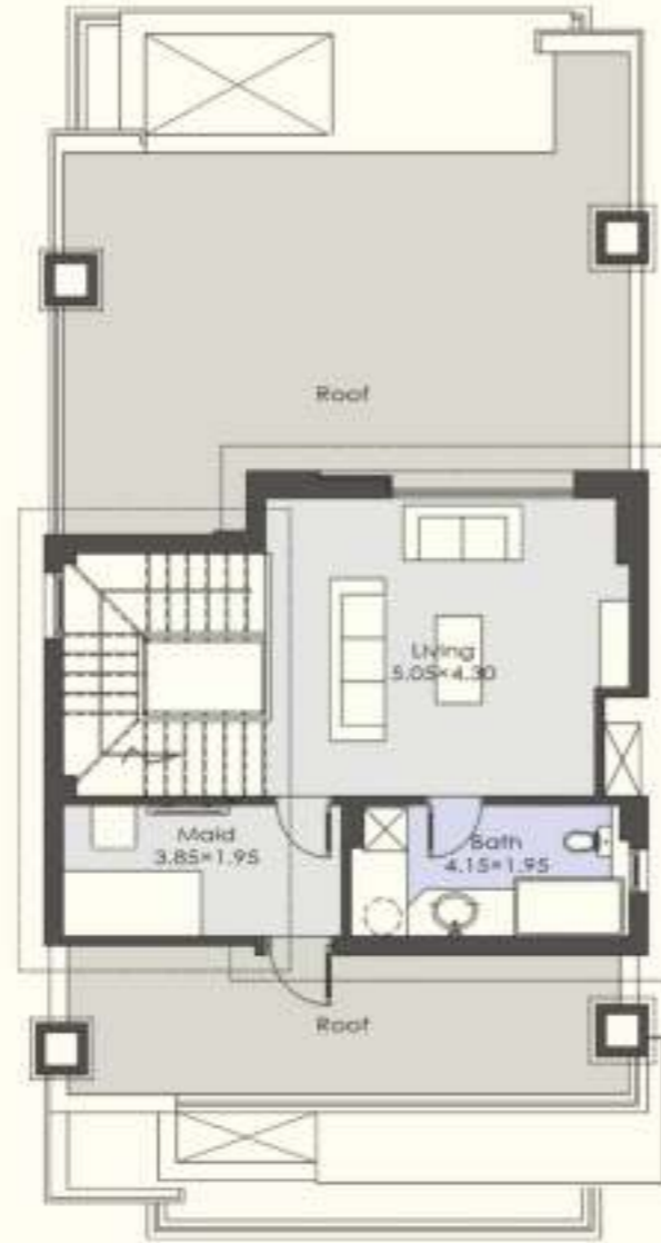
Roof Floor Plan